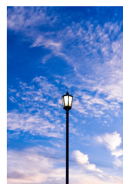
Let's LIGHT it Up!

We encourage the Property & Business Owners within the 80 Watt District to use the CPTED principles when landscaping and/or upgrading your business location. Call for more information on the programs available to support your efforts. 916-495-5599